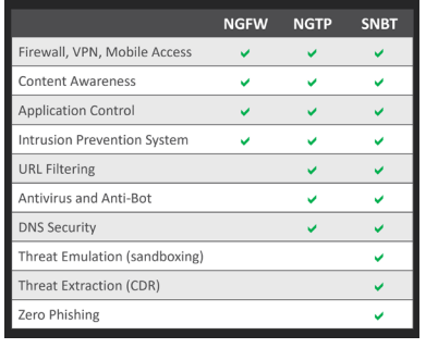
Next Generation Firewall, Next Generation Threat Prevention and SandBlast packages

Check Point SandBlast Threat Emulation is an evasion-resistant sandbox that provides zero-day protection from advanced and unknown threats. SandBlast Threat Extraction (CDR) ensures quick delivery of safe email and web content to users.